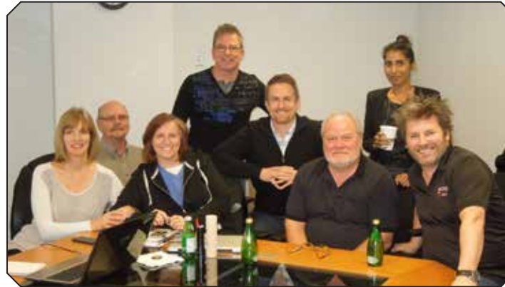
Regional Safety Advisor meeting March 2