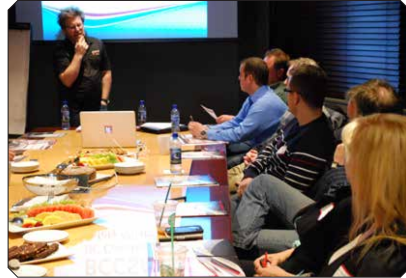
Safety Climate Tool Presentation March 17