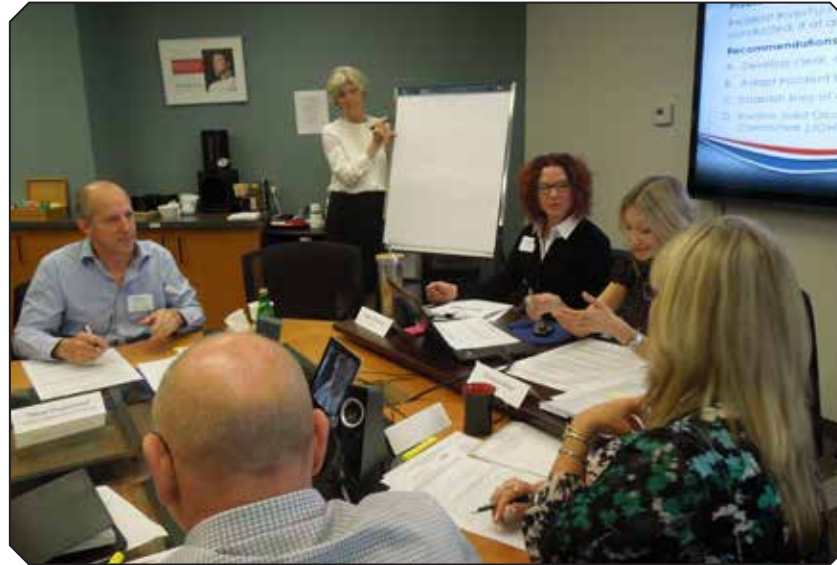
Road Maintenance Project meeting facilitated by F.A.S.T. Limited

In 2015, RSAs made 1155 site visits (an increase of 494 over the previous year), including 26 injury management related visits with WorkSafeBC representatives.