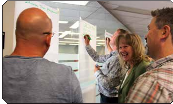
COR External Auditor Training

“ The Certificate of Recognition (COR) is a voluntary incentive program offered by WorkSafeBC. Companies that pass a series of audits are eligible for incentive payments. During 2015, 125 companies achieved OHS COR (67 Large COR and 58 Small COR). In all, $14,715,886 in incentive payments to BCCSA COR Certified companies were awarded. ”