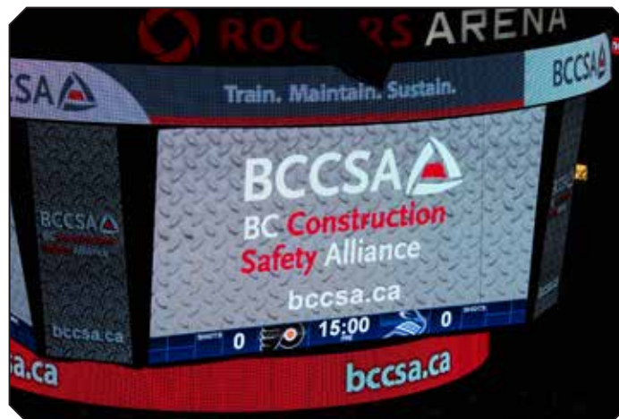
Safety Climate Tool (SCT) Presentation March 17