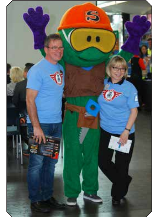
NAOSH Launch May 4th at BCIT