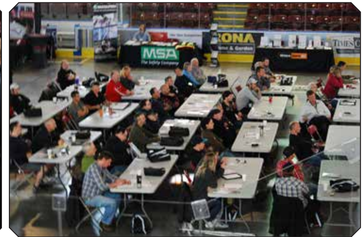
Steep Slope Roofing Symposium, Victoria BC April 25