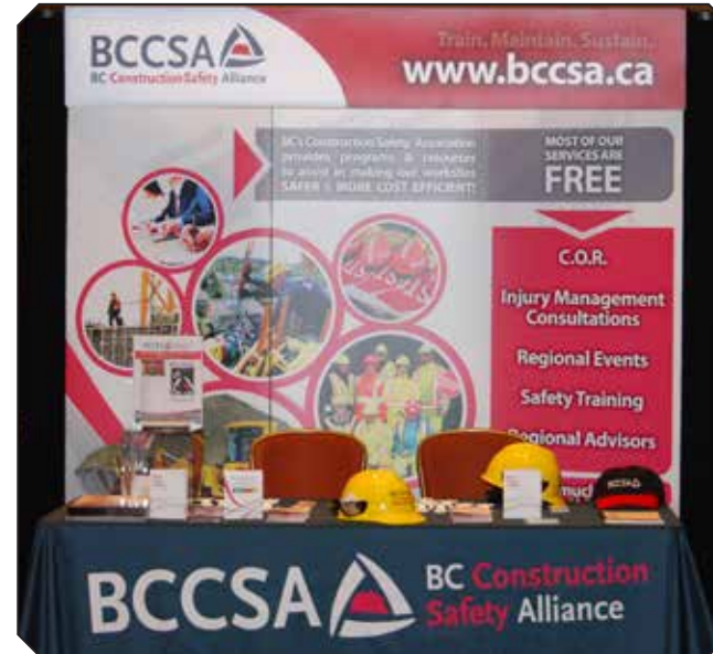
Construction Leadership Forum May 8 & 9, 2015