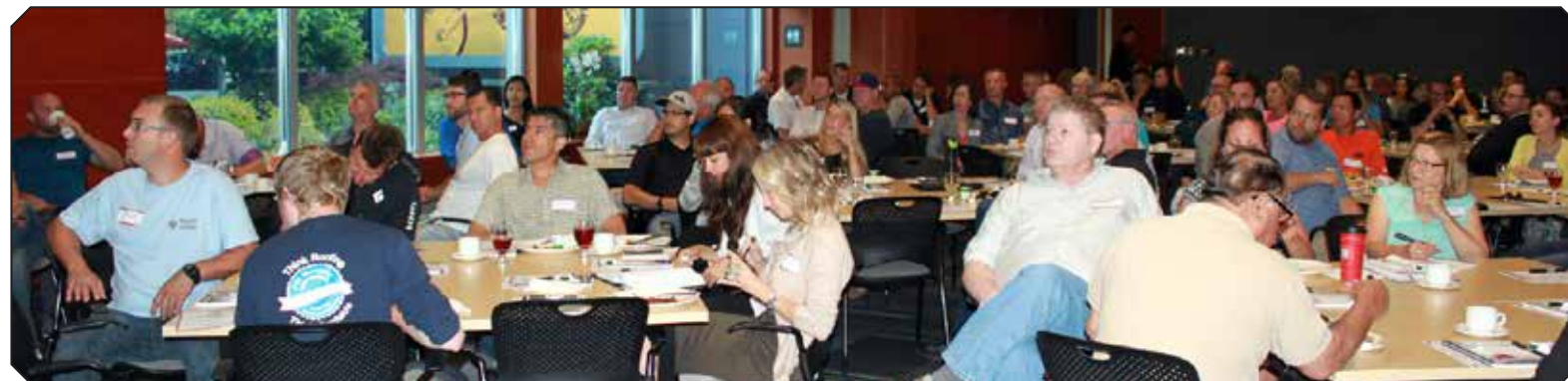
Vancouver Contractor Breakfast at Trev Deeley Motorcycles June 26

“The Traffic Control Person (TCP) training program is the only standardized program of its kind acceptable to WorkSafeBC under Section 18.6 of the Occupational Health and Safety Regulation for high-risk traffic control. During 2015, a total of 5,685 TCPs were trained, and another 1,010 were requalified, while 33 instructors completed the retraining/certification program.”