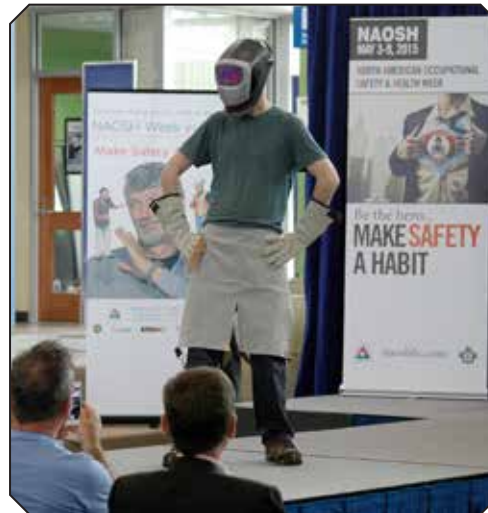
PPE Fashion Show @ NAOSH Launch May 2015

In response to ongoing high demand for our courses, we enhanced administrative support by adding a new staff person to the training team.