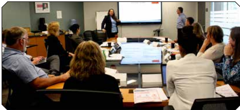
Traffic Control Person (TCP) Workshop

The benefits of COR are many, as evidenced by the growing numbers of both individual contractors who are applying for the certification and large purchasers of construction who are adding COR as a requirement for subcontractors wishing to bid on their projects. Among these is BC Hydro, which in 2015 began investigating the merits of COR.