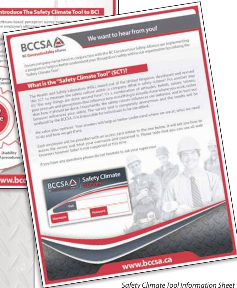
Safety Climate Tool Information Sheet