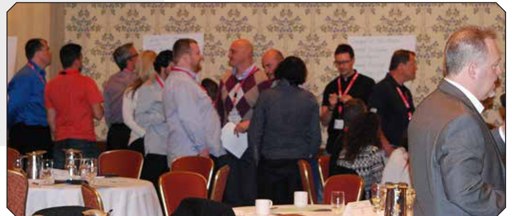
Construction Leadership Forum May 8 and 9, 2015

As WorkSafeBC's COR certifying partner for employers in the construction industry, we are