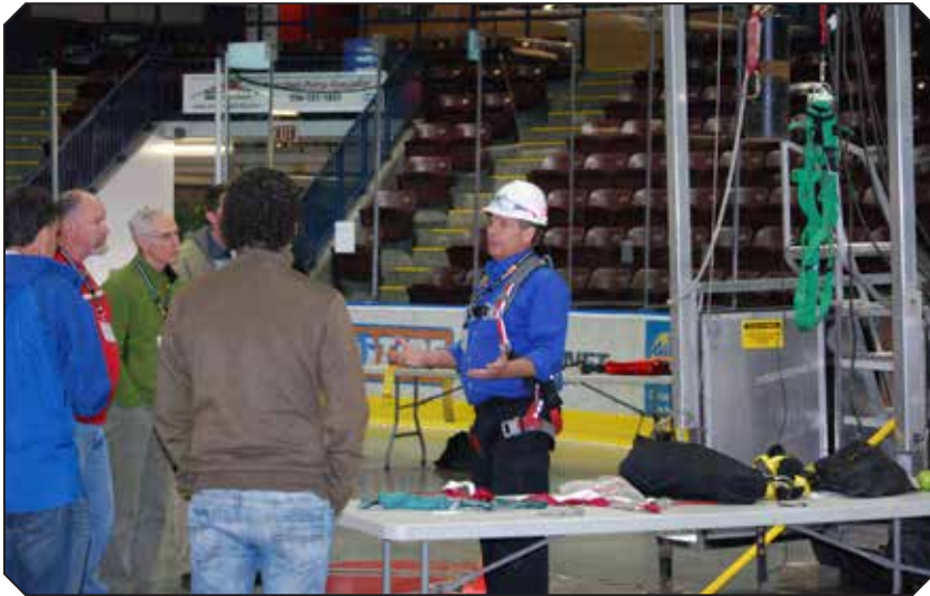
Steep Slope Roofing Symposium, Victoria BC April 25

While the Alliance continued to offer the CSS (which recognizes excellence in construction safety